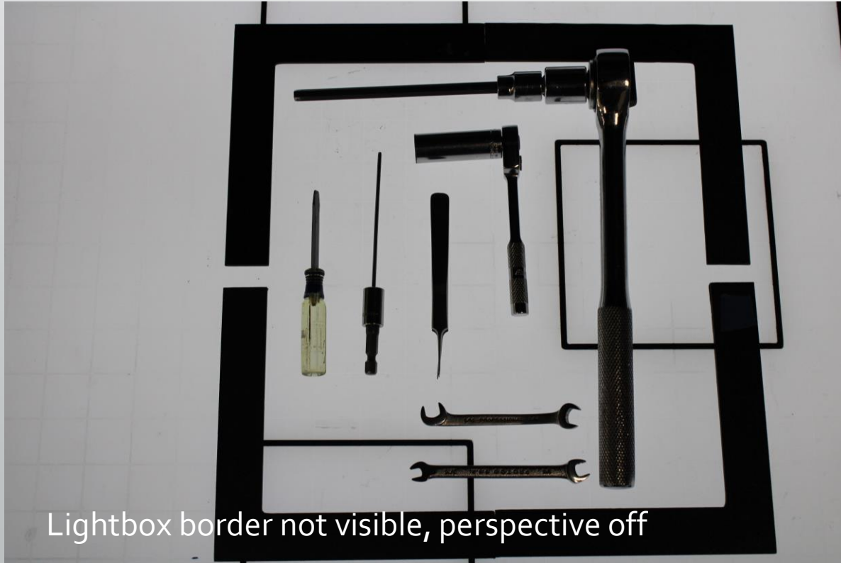
Lightbox border not visible, perspective off