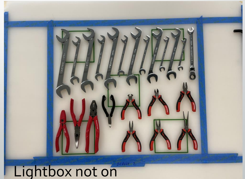
Lightbox not on

PLEASE NOTE: Final images should be greater than 1MB