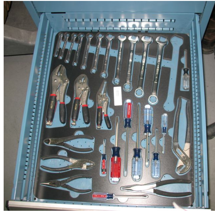
The End Result